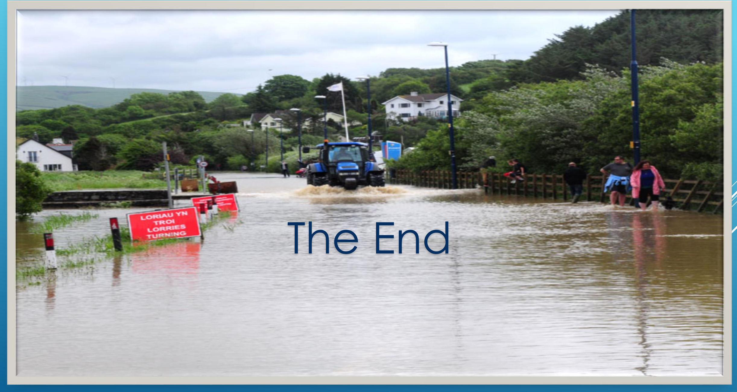
Borth & Ynyslas Community Flood Plan